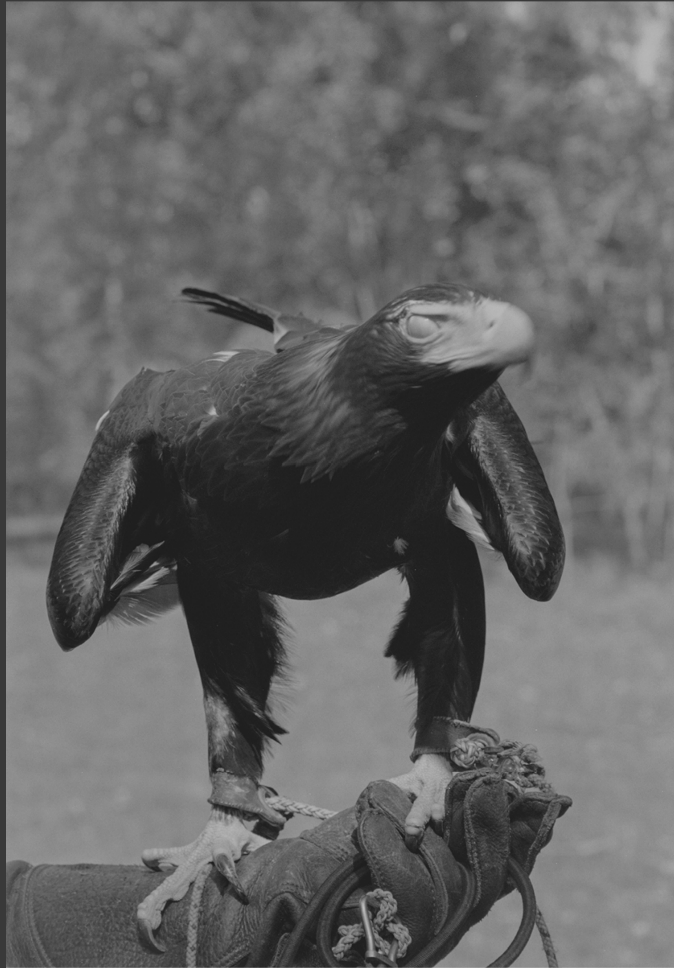
'The Killing Sink' - Matt Dunne