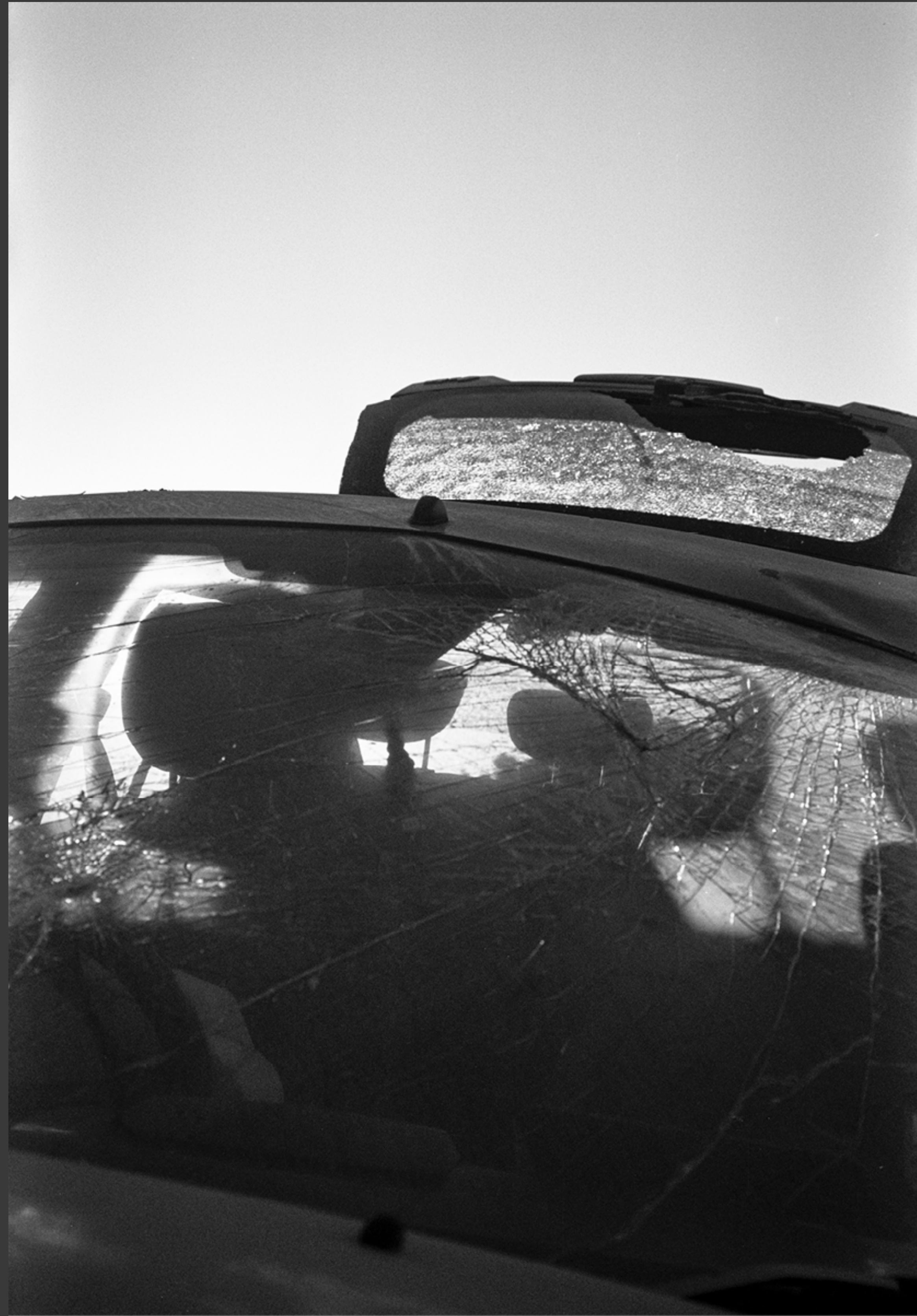
'The Killing Sink' - Matt Dunne