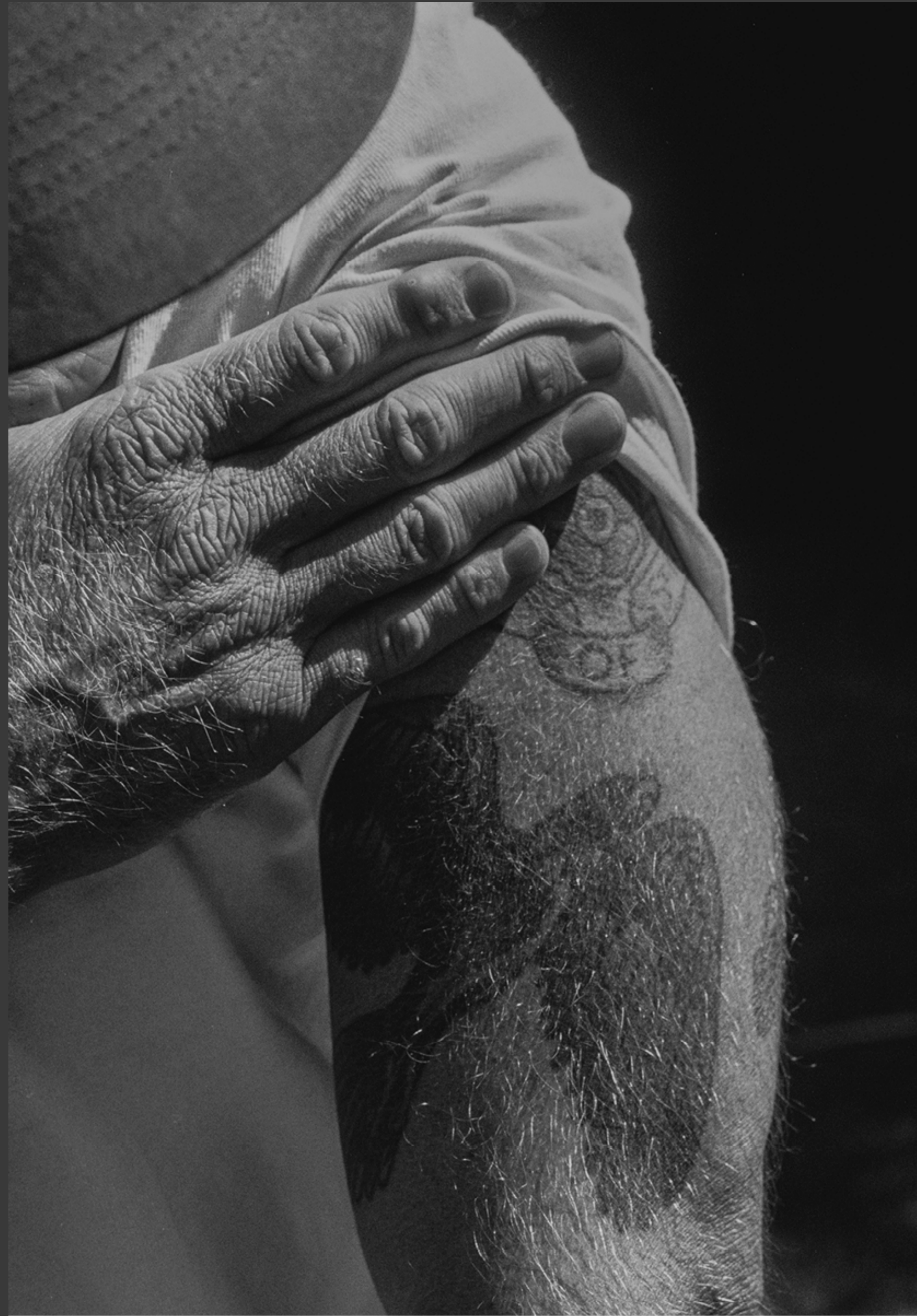
'The Killing Sink' - Matt Dunne