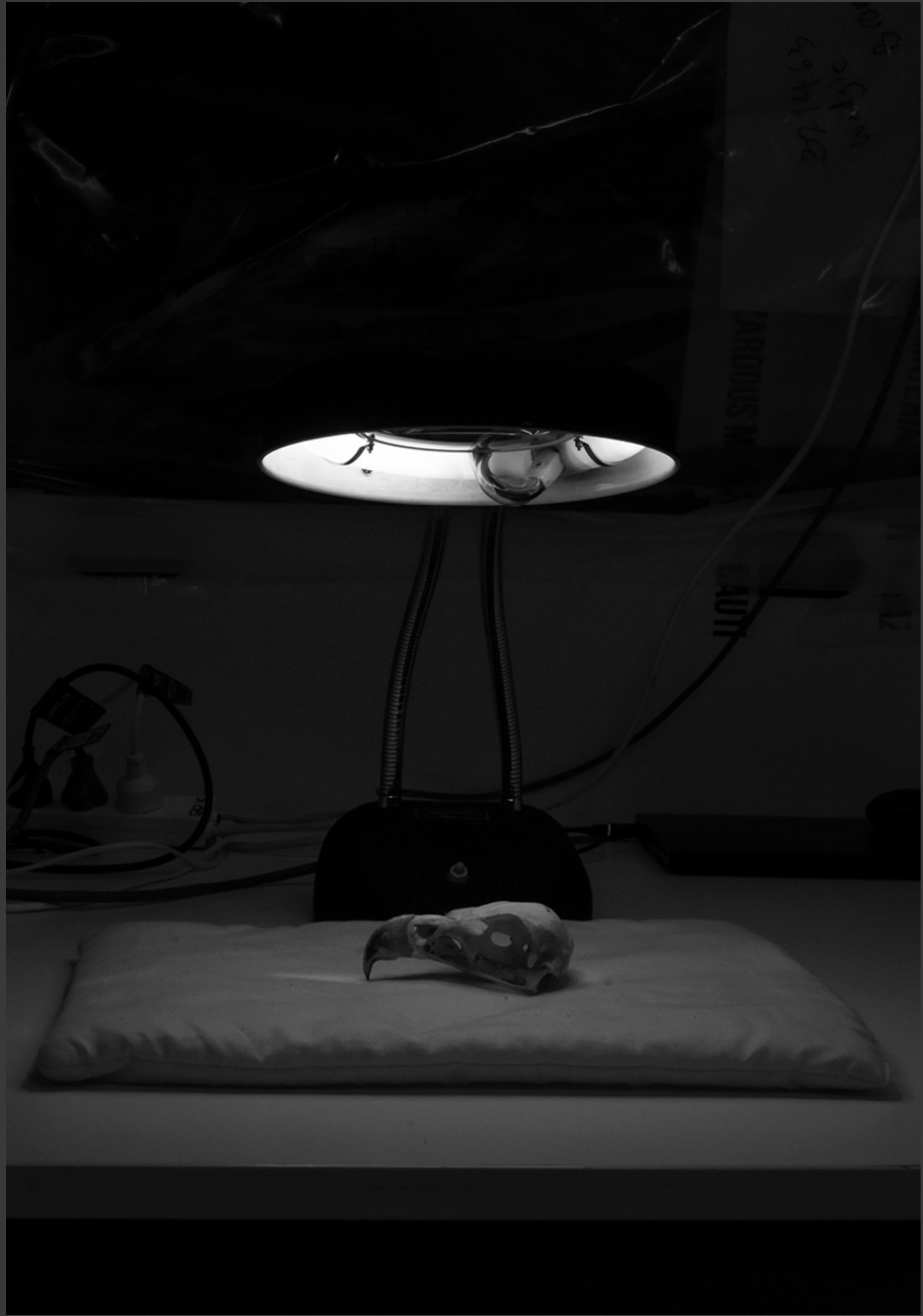
'The Killing Sink' - Matt Dunne